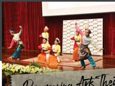
Performing Arts Theatre