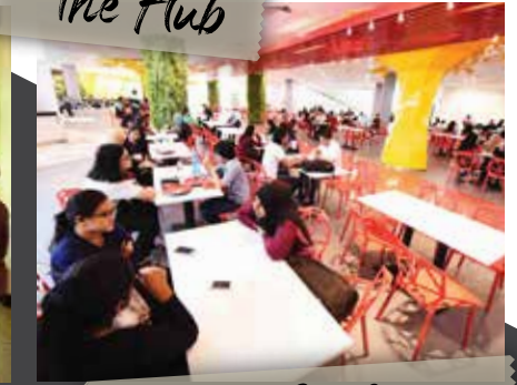
Books & Gifts