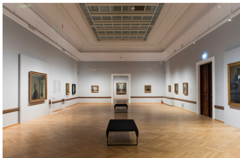
Vilhelm Hammershøi. Light and silence . Exhibition at the National Museum in Poznan 21 XI 2021-06 II 2022